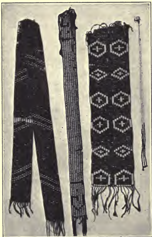
A COLLECTION OF WAMPUM AMERICAN MUSEUM OF NATURAL HISTORY, N. Y. Nos. 150.1/1945, 1579 A.D. 50/2287, 2902